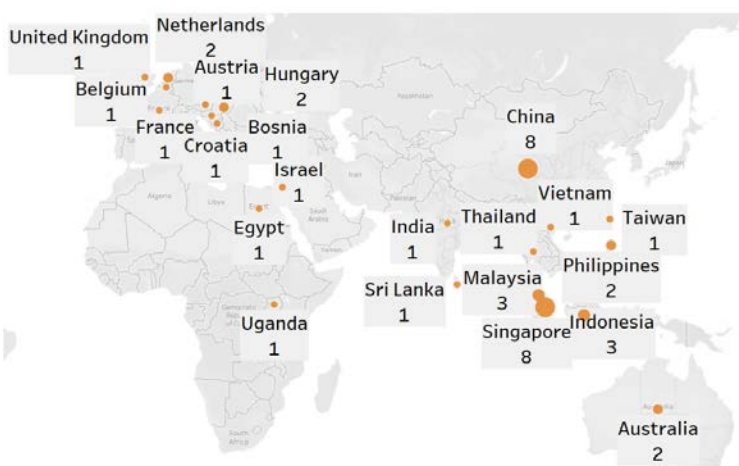
Number of participants attending the program based on Nationality, N=44