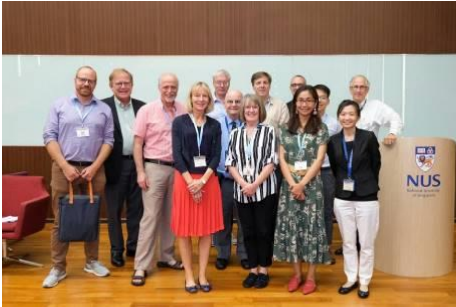
International and local researchers working on the biology of ageing.